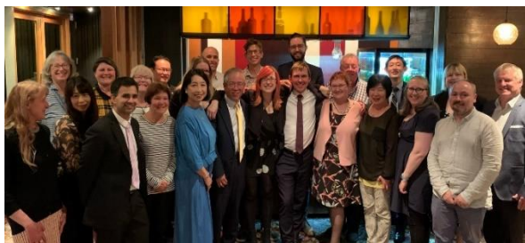
Sakai-Wellington Marathon Exchange Celebration Dinner (Nov 2021)